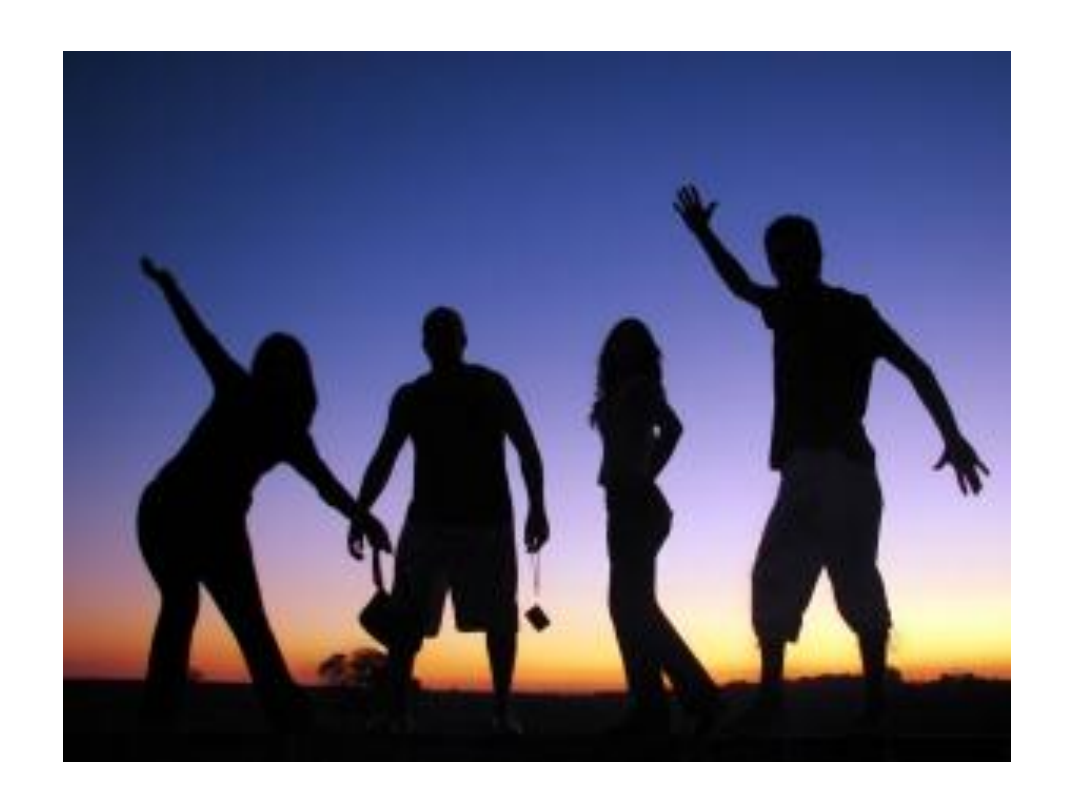
The Confidence Factor

Every day, in one way or another, people are faced with challenges, and while some are relatively small, others can be quite overwhelming. Therefore the need for confidence is essential if the individual is going to be able to handle these life issues adequately and effectively. Get all the help you need here.