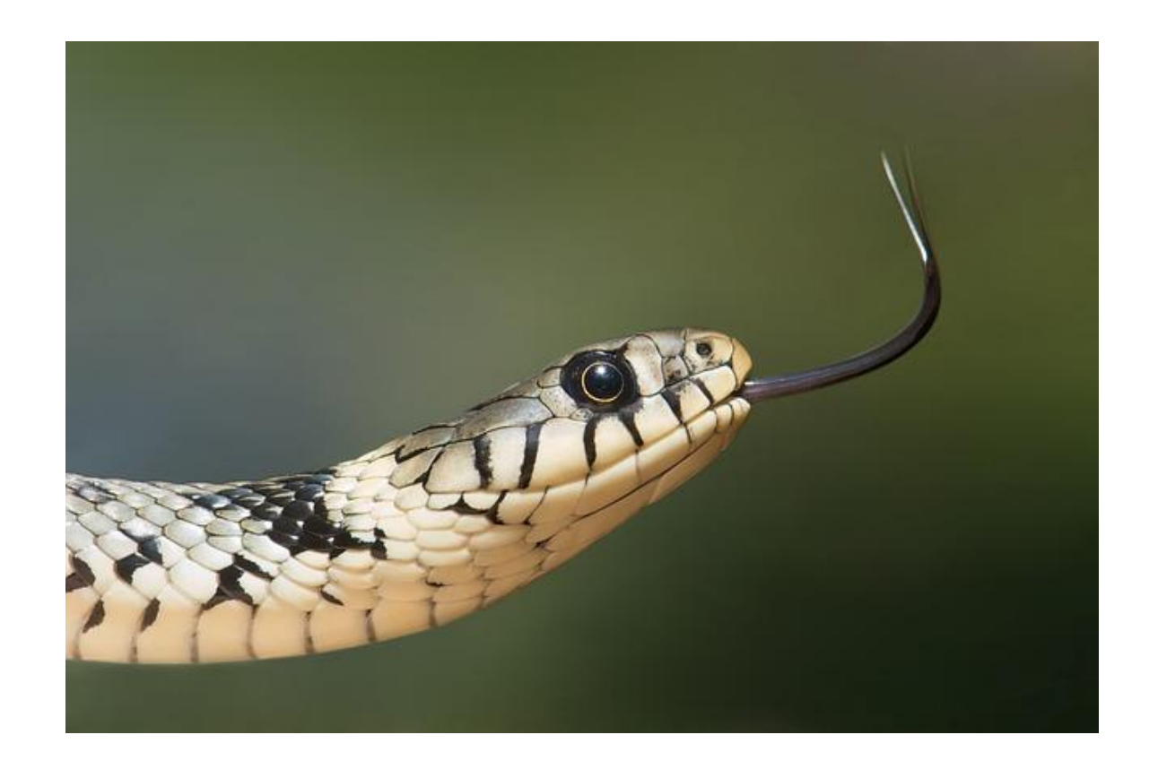
Slithery Creature Care

Getting to know a little more about reptiles and the basic care required would help the individual make decisions on its suitability as pets. This is often necessary, as reptiles are not really considered a common choice for a pet; therefore there is not a lot of supporting material easily available on them for the individual deciding to have one as a pet.. Get all the info you need here.