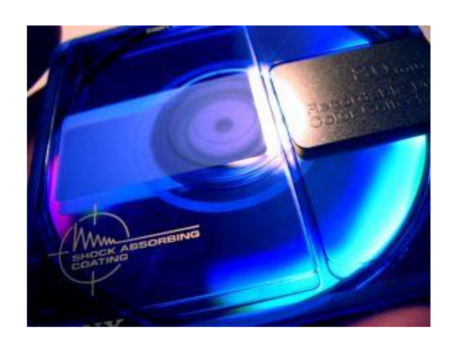
A Closer Look At The Tools

Computers are quick enough to run even demanding audio applications and pro programs frequently provide more functions than you really require.