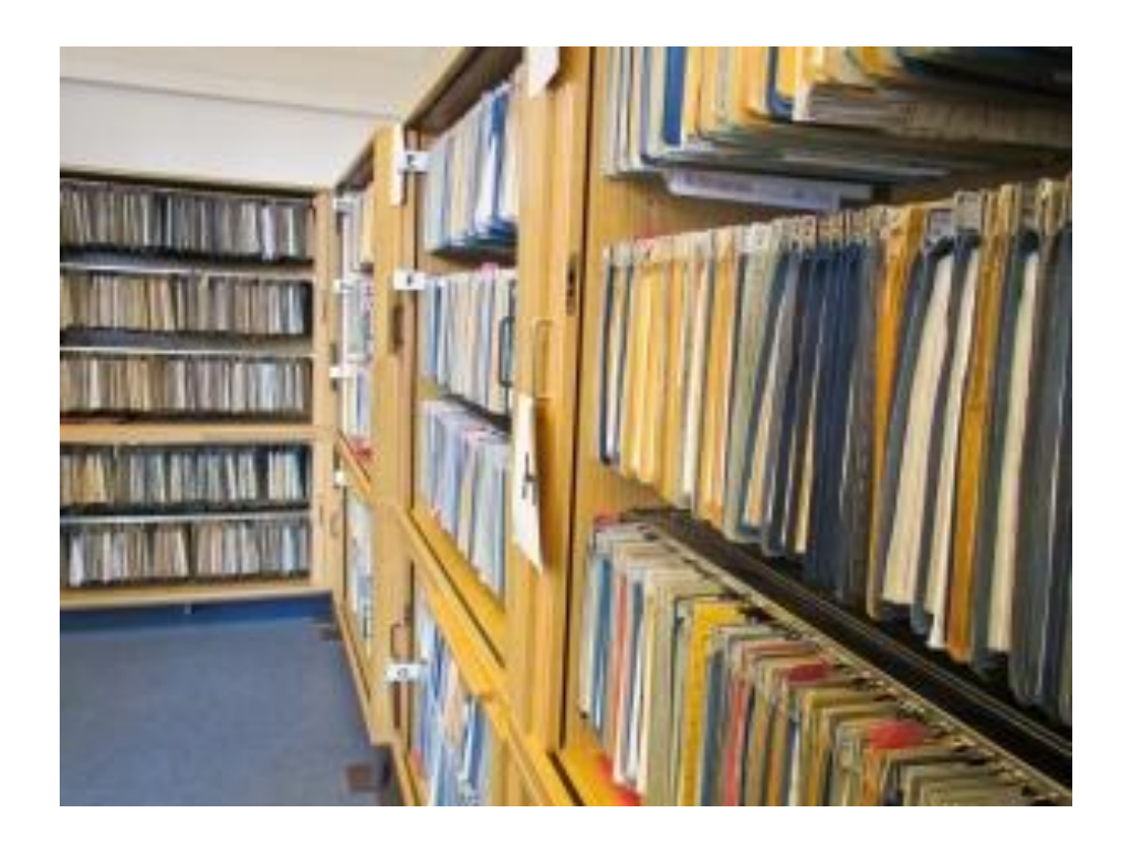
Productivity Without Pain

Being able to do little yet reap a lot is every individual's ideal work formula. Though not always possible there are some interesting ways this can be achieved to some level of satisfaction for all.