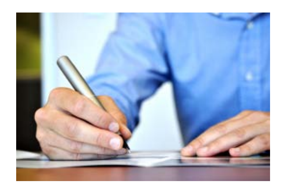
Home Business Handbook

And so, how do you accomplish that effectively? Here are a few awesome hints on how you're able to become that amazing home business owner.