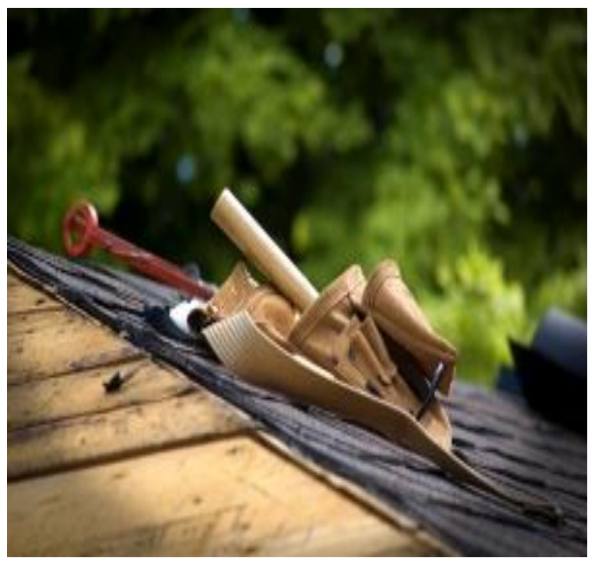
Be Well Equipped!

Working on D.I.Y. projects can be very rewarding if the individual is well equipped mentally and physically. Therefore, before actually attempting the jobs, one should be fully prepared in these areas.