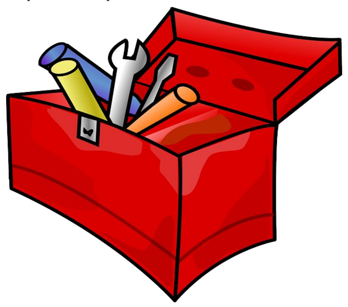
Handyman At Work

When it comes to having the right handyman tools, getting a set with some level of quality is better than just throwing together a few bit and pieces to make up a kit.