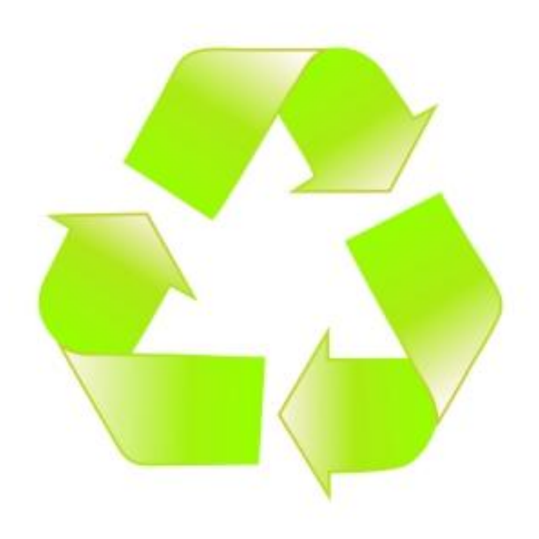
Going Green For More Cash

Going green is one of the hottest topics explored today. Almost everyone is into this new "fad" and this is of course a very positive behavioral pattern if correctly nurtured. Learn how here.