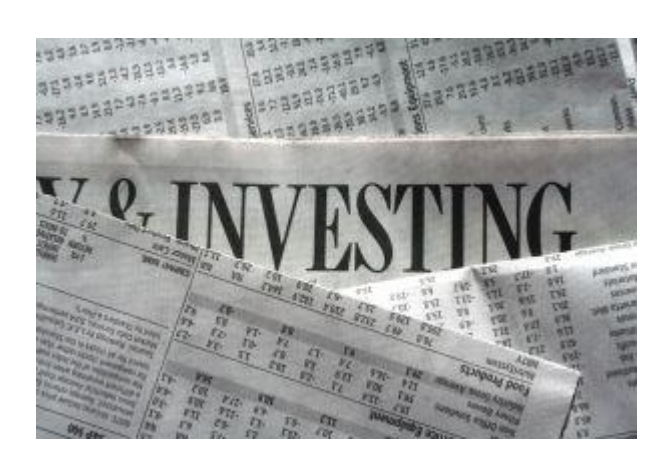
Forex Fortunes Guide

The aim of this book is to give readers a brief overview on Forex markets from the means through which traders can develop the proper mindset when trading, how to trade on the Forex market, why emotional management is critical to successfully trading on the Forex market, to discussing some of the favorable qualities a good Forex trader should posses. These aspects of Forex trading will be discussed in depth in the other chapters that follow but for now, we tackle the basics pertaining to Forex trading as a money making entity. Get all the info you need here.