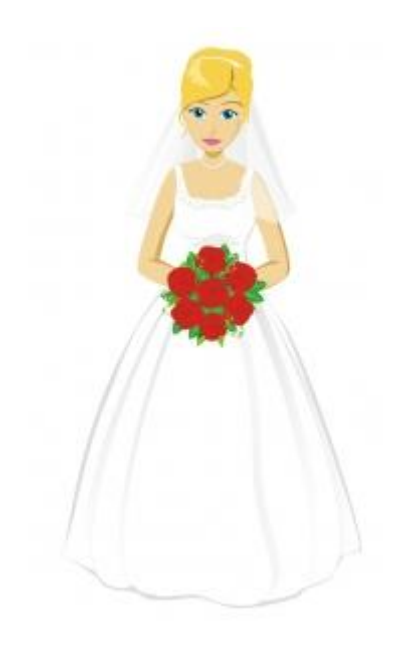
First Year Marriage Survival

Surviving your first year of marriage when you are a new couple can be challenging, especially if you are still learning about the other person. Generally, it is better to get to know someone before getting married but we all know this isn't how things happen in life. You meet someone special who melts your heart and next thing you know, you're head over heels for them. Already, you've been thinking of getting married and rush into things too soon. We've seen it so many times before with couples all over the world. Get all the info you need here.