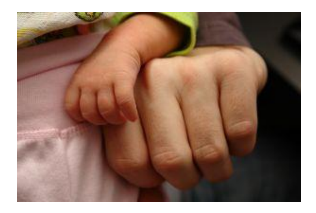
Child Diet Dilemma The Best Ways To Healthy Eating For Children

Nutrition for children is a very important subject that parents should be aware of and incorporate into their child's daily dietary intake. Proper nutritional balance will allow the child the opportunity to have a good growth potential. Get all the info you need here.