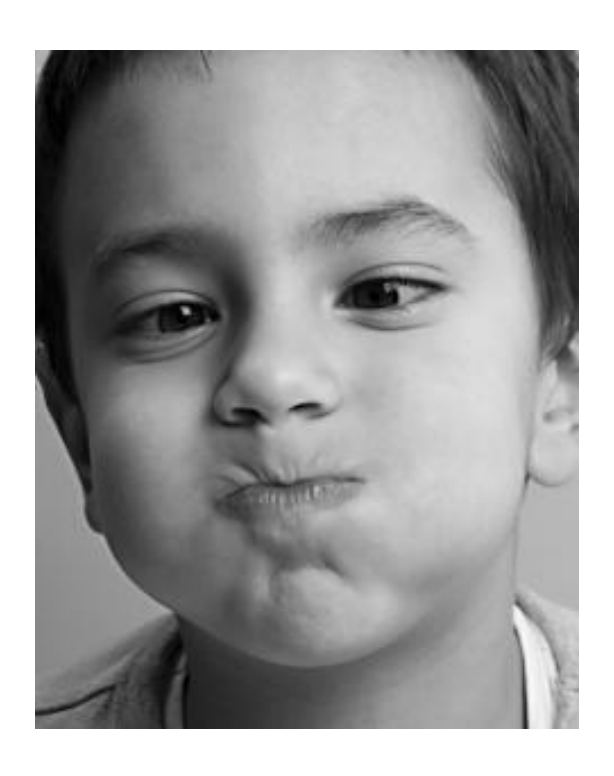
Childcare Goldmine Develop Babysitting Into A Successful Business

With most parents today opting to go back to work full time there is a need to find reliable and reputable childcare help. There are many establishments that offer such services but a discerning parent would wisely research the centre before actually making a commitment to send his or her child there. Places that offer childcare help which encompasses the essence of safely, health, promotions of physical, emotional and cognitive skill should be seriously considered as a requirement and a necessity and not just an advantage. Get all the info you need here.