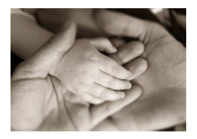
Empowering The Child

It is quite simple to be able to provide for the basic necessities of a child such as food, clothing, shelter and others. However when it comes to providing the nurturing element in a child's life a little more thought and energy needs to be exercised. There are some general guide lines that can and should be followed to ensure the emotional health development of a child.