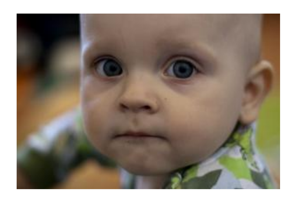
Avoiding The Baby Battles All About Planning The Children In A Marriage

Planning for a baby should not be taken lightly as it usually entails a lot of detailed issues that should be ironed out and completely understood. This is very important to understand, as along with the new baby there will be a lot of uncompromising adjustments, which have to be made that will certainly add pressure to the existing problems within the relationship. If both parties are not ready for these inevitable changes, the relationship could crumble under the intense pressure of it all. Get all the info you need here.